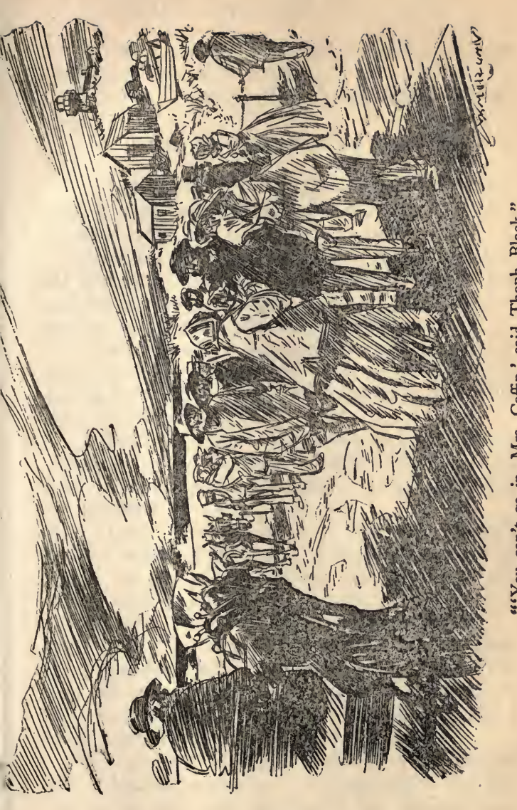
"You can't go in, Mrs. Coffin,' said Thoph Black."